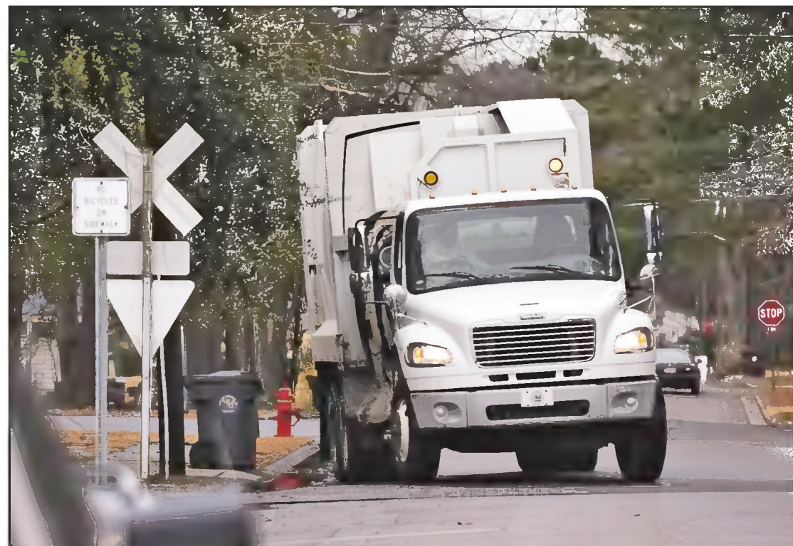
Trash collection in Raeford this week. Glass is out of favor.