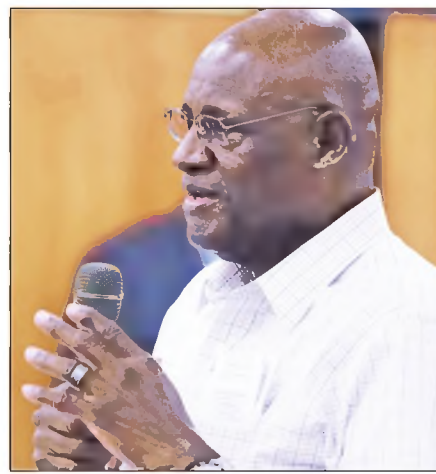
Porter speaking to a banquet audience. (File photo)