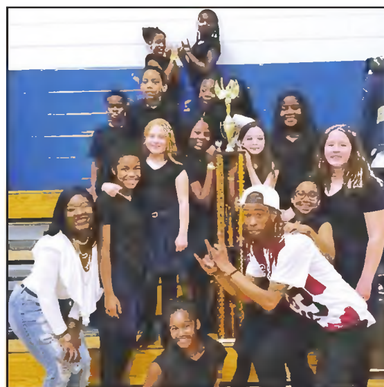
The Elements of Class step team.

Elements of Class was named Grand Champion in the HBCU Classic show in Sumter, South Carolina and in the Step to the Stage show in Charlotte. The group won first place in both of those competitions, as well as placing first in shows in Clinton, Rocky Mount, Greenville, Virginia Beach and Garner. Other performances include participating in National Night Out, events at the Rockfish Motorsports Speedway, Jamming for Jesus, the MLK Celebration in Lumberton and the Black (See STEP TEAM , page 11)