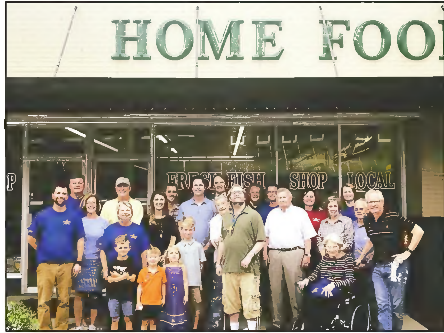
The McNeill family gathered in front of the store.