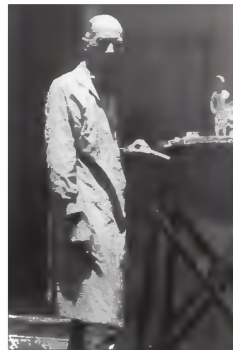
Covington at work.

Wednesday afternoon, Calvin Newton led me around the grounds of