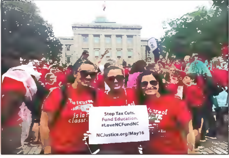
Teachers from Don Steed Elementary joined the rally in 2018.