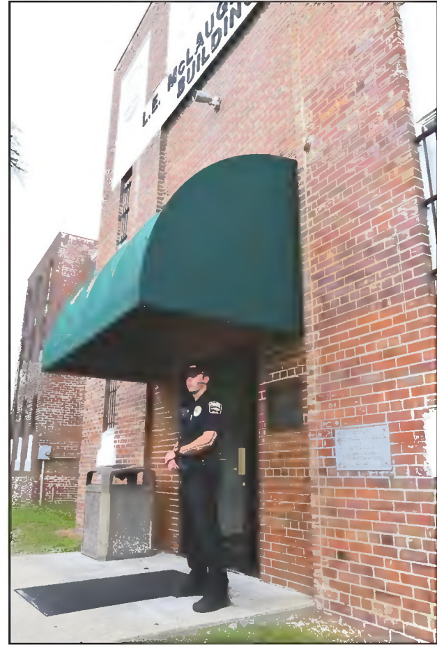
The SBI returned in August, 2017—to the L.E. McLaughlin Building. (File photo)

The SBI raided Hoke County government offices (See WARRANTS , page 4)