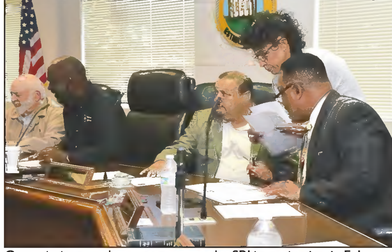
Commissioners plan a response to the SBI investigation in February, 2017.