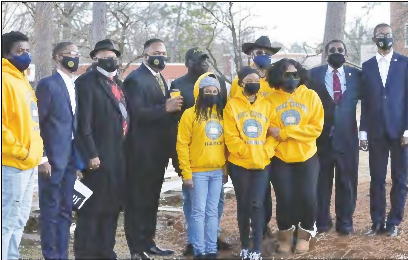
The Hoke County NAACP, Ministerial Alliance and Maggie's Outreach held a march and outdoor celebration of Dr. Martin Luther King Jr. Day Monday, attended by members and local elected officials.