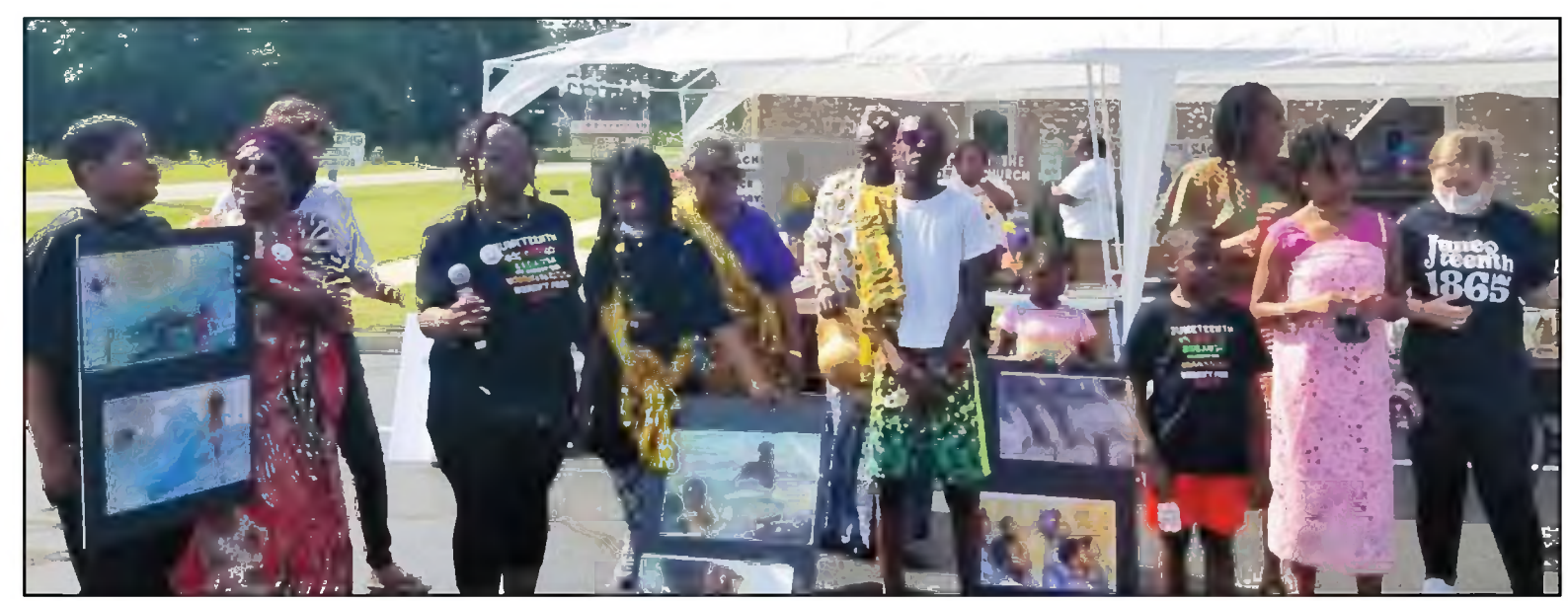
Above: Freedom Marchers at Hoke's Juneteenth celebration; top right: art on display; bottom right: youth volunteers for the occasion. (Contributed photos)