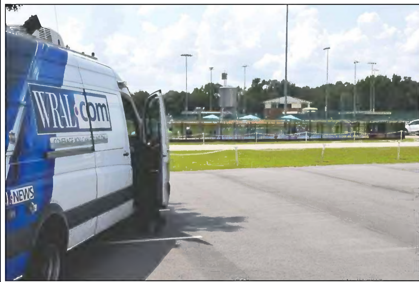
A TV crew sets up near the splash pad at the county sports complex on N.C. 211. Gunfire began nearby Monday night resulting in the deaths of two people.