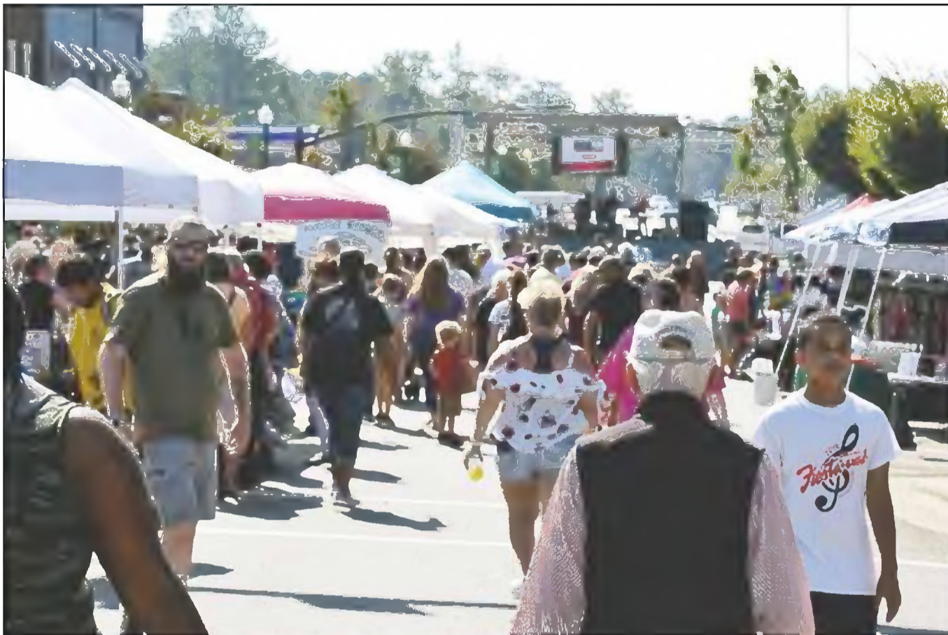
Main Street was packed as the Fall Festival returned from a COVID-imposed absence.

Hoke County Schools reported just 16 cases among students and staff last week. For the week ending Friday, October 15, 14 students and two staff members reportedly tested (See COVID, page 4)