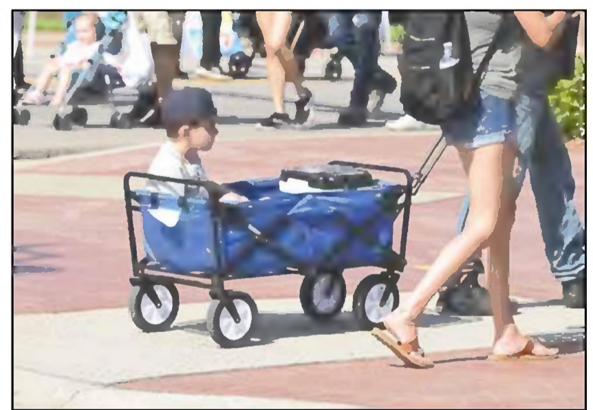
A child sees the festival from a wagon.