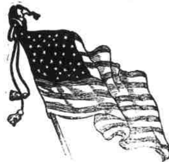
NOT A RED CENT.

The attitude of the United States upon topics before the Paris Peace Commission has been clearly defined by the positive refusal of the American government to accept any responsibility for Cuban obligations. While the United States will not pay one red cent of Cuban debt, we do not wish to pose as a conquering nation, but will not only undertake to maintain good order in Cuba from an American standpoint, but will enforce such a condition of affairs. Cuba must, like Porto Rico, be evacuated by Spanish authority, then the United States will speedily determine its future. If by no other means than absolute American authority will give the people peace and prosperity in their pursuits, then that will be the ultimate result.