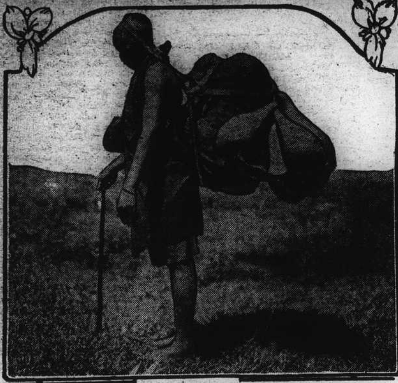
One of the Natives of Kenya.

(Prepared by the National Geographic Society, Washington, D. C.)