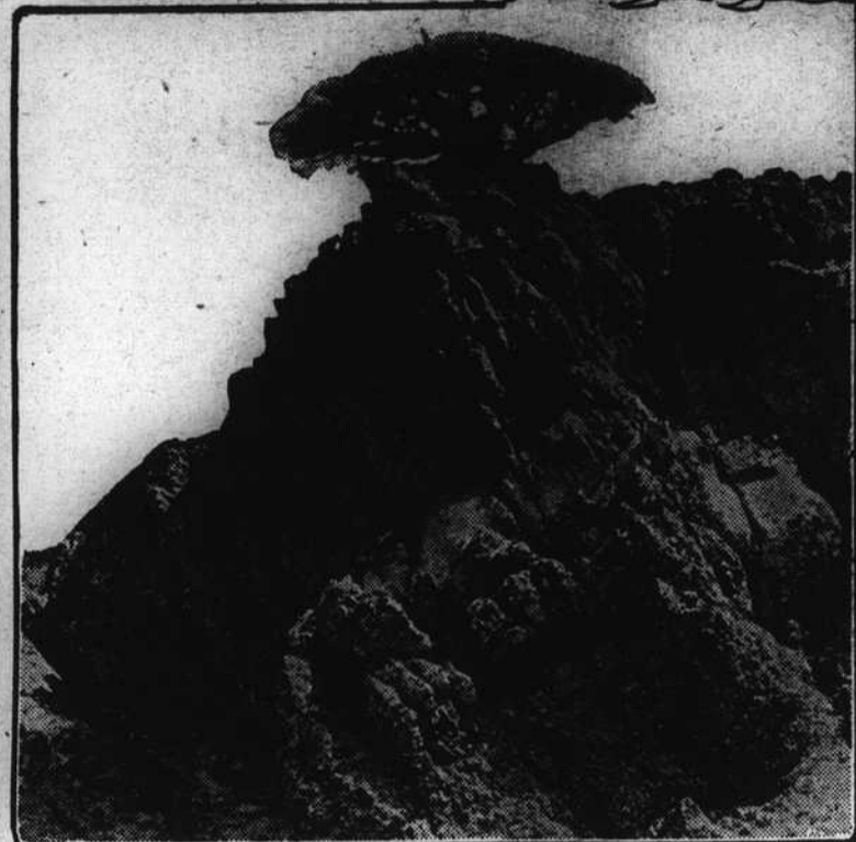
Cliffs of a Lower California Island.