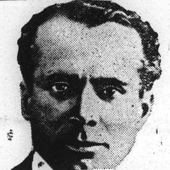
General Umberto Nobile, commander of the dirigible Italia, which recently crossed over the North Pole.