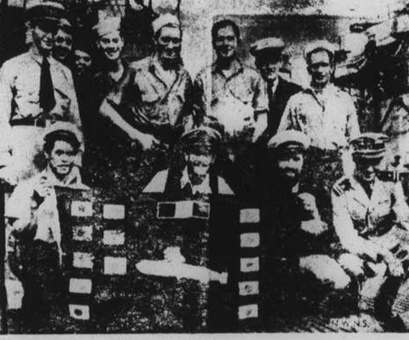
Thirteen is the lucky number of the crew of this U. S. submarine but unlucky for the Nips. The sub's special tally flag, with its own device in the center, counts ten Jap merchantmen and three Jap war ships sent to Davy Jones' locker.