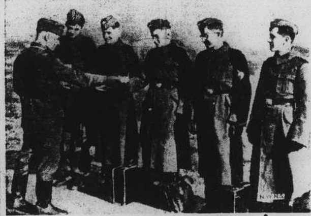
Youngsters of the Hitler youth organization are shown receiving orders as they report for duty with the lutwaffe. Terrific casus es suffered by the German armies call for replacement by the Is-rest and men in reserved and vital positions. These youngster on Hitlerism and Naziism most of their lives, seem kee-master.