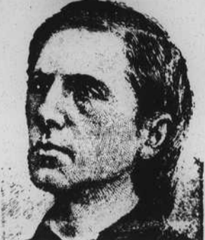
Commander W. B. Cushing, U.S.N.

boat forerunner of the modern destroyer. At that time, in 1890, Secretary of the Navy Tracy said Cushing displayed a "rare union of prudence and audacity" and a "fertility of resource."