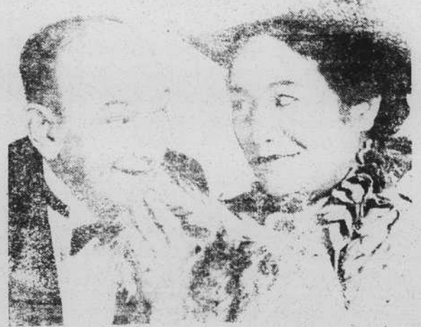
Leon Errol and Hilo Hattie are seen from the picture "Follow the Band" at the Lester Saturday.

LESTER SATURDAY—You will Howl with Laughter— "FOLLOW THE BAND" —Leon Errol and Hilo Hattie.