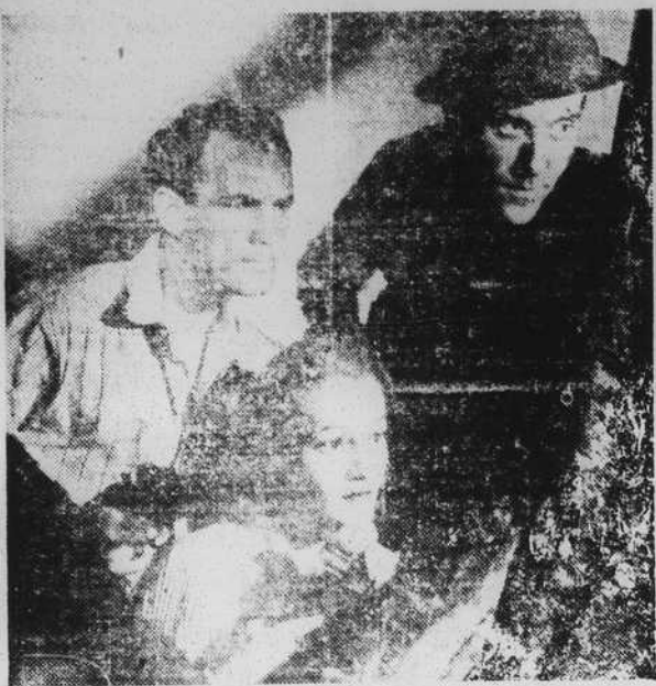
A crucial situation in "Song of Bernadette" finds stars Constance Cummings, Clifford Evans and Tommy Trinder ready to battle it out with the Nazis.

LESTER SATURDAY—You will Howl with Laughter— "FOLLOW THE BAND" —Leon Errol and Hilo Hattie.