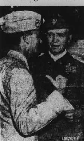
Marshal Pietro Badoglio, Italian military chief, right, and Brig. Gen. Maxwell D. Taylor, deputy of the Allied military mission, as they arrange for a press conference.