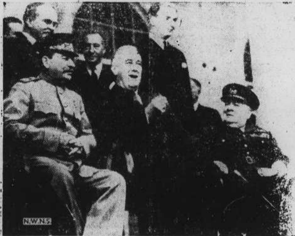
Premier Joseph Stalin of Russia, President Franklin D. Roosevelt of the United States and Prime Minister Winston Churchill of England met in Teheran.