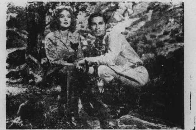
Maisie is a daisy but she's one daisy who tells all in M-G-M's latest picture, "Maisie Goes To Reno," starring Ann Sothern.

SATURDAY ONE DAY — AT THE LESTER THEATRE