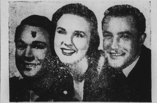
Dean Harens, Deanna Durbin, and Gene Kelly in a scene from the thrilling Universal picture, "Christmas Holiday," with Richard Whorf.

FRI.-SAT. at THE STRAND—Matinee and Night