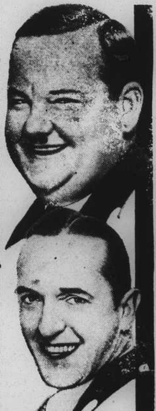
STAN LAUREL and OLIVER HARDY