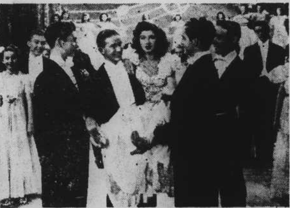
Peggy Ryan with your hit parade of young entertainers in Universal's latest film musical, "Babes On Swing Street."

AT THE STRAND MON.-TUE—TWO DAYS With LAUREL & HARDY in "BEAU HUNKS"