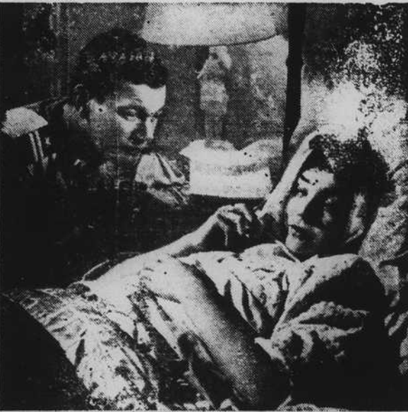
Joseph Cottens examination of her unromantic mumps wrecks have with Jennifer Jones' emotional stability in this merry scene from David O. Selznick's bear-warring panorama of the home front, "Since You Went Away," now playing at the . . . Theatre through United Artists release. Cottens and Jones share starring honors with Claudette Colbert, Shirley Temple, Monty Woolley, Lionel Barrymore and Robert Walker.

MON.-TUE.-WED.—at THE LESTER "SINCE YOU WENT AWAY" at POP. PRICES