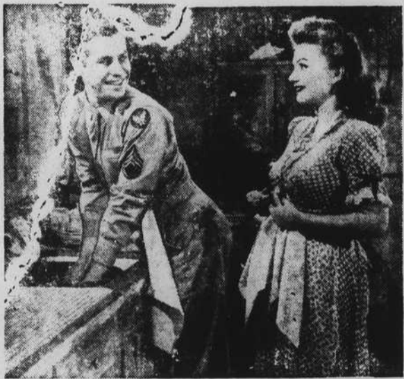
STARTS L. S. SUN. NITE 12:02 & MON.-TUESDAY "BETWEEN TWO WOMEN" VAN JOHNSON

AT THE LESTER THURSDAY-FRIDAY — "SUNDAY DINNER FOR A SOLDIER" WITH JOHN HODIAK ANNE BAXTER.