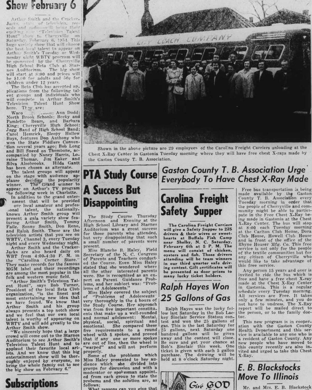
Shown in the above picture are 29 employees of the Carolina Freight Carriers unloading at the Chest X-Ray Center in Gastonia Tuesday morning where they will have free chest X-rays made by