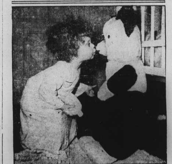
'NIGHTIE NIGHT' by Tom Marx of Euclid, Ohio is the type of simple flash photo that can win a photo contest. This one was a Sylvania 'Folks are Fun' winner in 1953.

Camera Topics Simple Pictures Often Win Top Contest Prizes