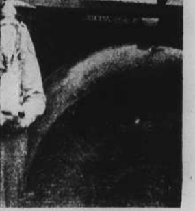
The American Red Cross Bloodmobile will be in Cherryville on Thursday, June 16th, at the Carlton Club House from 10:00 A. M. to 4:00 P. M.

The response to the blood program in Gaston county is lagging behind the quota and every one is urged to take time out Thursday and visit your bloodmobile at the Carlton Club House. The need is urgent. Doctors and the hospitals in Gaston county need blood every day. They get from the Red Cross blood bank, but the bloodbank can give out blood only when they get it on these visits.