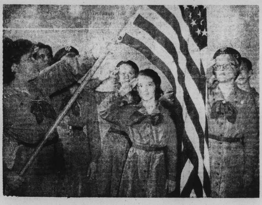
GIRL SCOUTS include respect to the flag in their Citizenship Training in troop meetings.