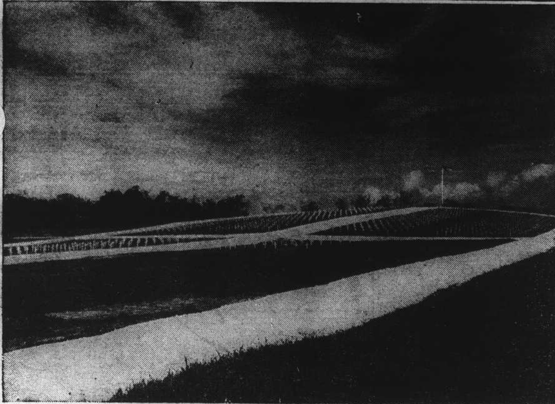
THEY DIED FOR AMERICA—Munda Cemetery, on New Georgia Island, the resting place of hundreds of American fighting men—possibly even of some one you knew. That these men shall not have died in vain, buy an extra $ 00 War Bond today.