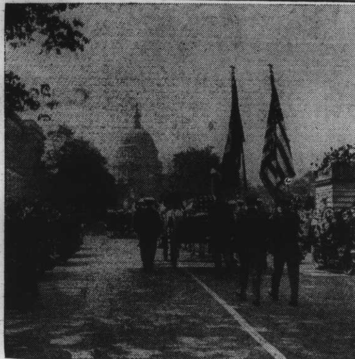
AS MILLIONS PAY LAST HOMAGE — With the Capitol dome an imposing backdrop, the military procession, headed by the caisson bearing Franklin D. Roosevelt's body, winds its way down Delaware Avenue toward the White House. The sad journey from Union Station was viewed by millions. The Presidential and U. S. flags bring up the rear.