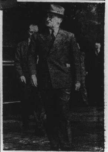
ENTERING WHITE HOUSE. President Harry S. Truman, shown above, entering the White House has recently received a loyalty pledge from Democratic Senators.