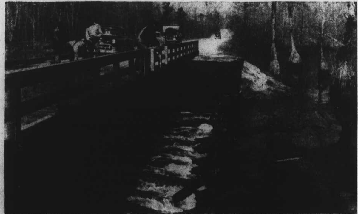
MILL DAM GONE—This photo was made moments after the dam at Merchants Mill was blown up by State Highway workers last Friday. Plans now call for a new and higher dam with gates to allow raising or lowering the water level.

Gatesville Methodists say they will come up with a real entertaining program on Saturday night, April 16, when they introduce a show of 30 stars from Central Prison, Raleigh. The show will begin at 8 p. m. in the Gatesville school auditorium and will feature singing, dancing, comedy and music. Proceeds will go to the Methodist Church building fund.