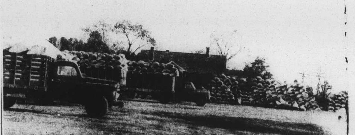
THESE ARE PEANUTS-Approximately 2,000 bags of peanuts were loaded on these trucks and on the ground at Knights hog buying station last Wednesday morning. Knight said he had