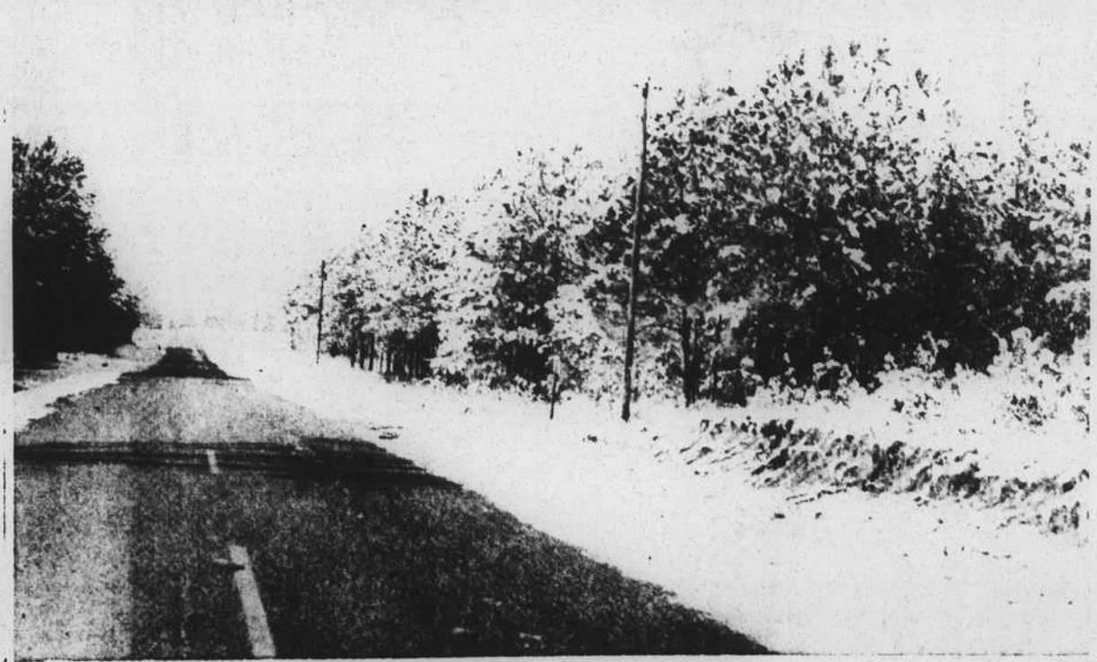
WINTER-A lot of North Carolina people were singing and dreaming of a white Christmas and may have been disappointed. but if they stuck around until last Friday they had plenty of

snow as more than two inches fell in a short time. Who can