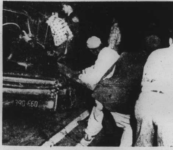
After the wreck is over.