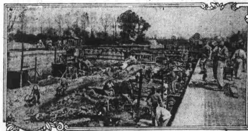
SOLDIERS IN THE VERDUN SECTOR REPAIRING A RUINED CANAL

The Franco-Prussian war of 1870-1871 taught the French people the meaning of thrift and economy. So well did they learn this lesson, that the whole sum of the indemnity demanded by Germany, $1,000,000,000, was raised within the republic's con-