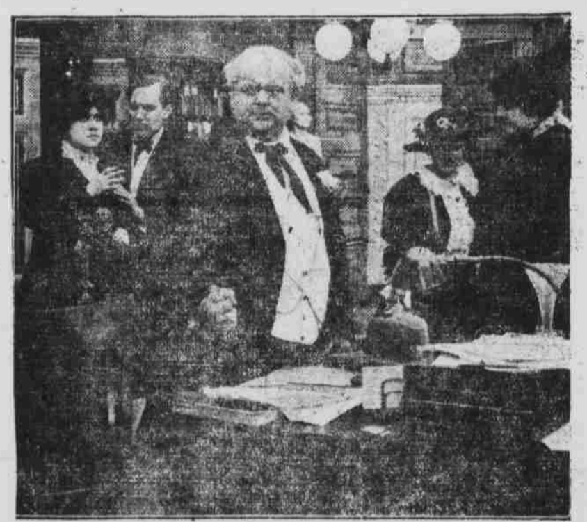
A scene from the Gentleman from Mississippi, a five reel World Film Corporation feature booked to be shown at the Paris today.