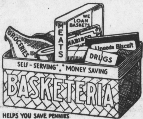
HELPS YOU SAVE PENNIES