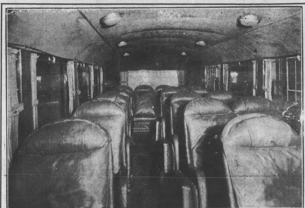
Photo shows luxurious and comfortable interior of Greyhound bus in which those winning a trip to the World Fair will travel.

Personally Conducted All-Expense Tour On DELUXE GREYHOUND BUS