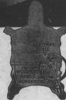
Above shows the one-inch of the hide which furnishes the leather for Wolverine Shell Horsehide. Note the shell that gives you many extra months of wear.

In an actual test, a Wolverine Shell Horsehide and a work shoe of another make were frozen in a cake of ice 56 hours. When the ice melted, the Wolverine Work Shoe dried out soft and pliable, while the other shoe was stiff and hard! That's the kind of leather we offer you in Wolverine Work Shoes. Come in and compare the many other Wolverine features of comfort and long wear—at prices that save you money in the long run.