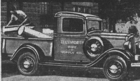
Half-Ton Pick-Up, $465 (112" Wheelbase)