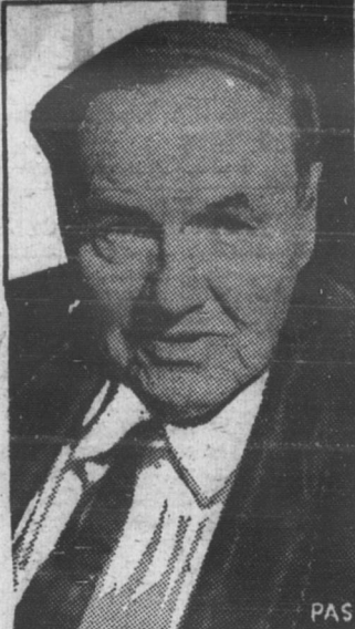
CHICAGO . . . On his 78th birthday, Clarence Darrow (above), noted criminal lawyer, talked on life, death and God. Long known as an agnostic, he reaffirmed his conviction that after life there is "nothing."