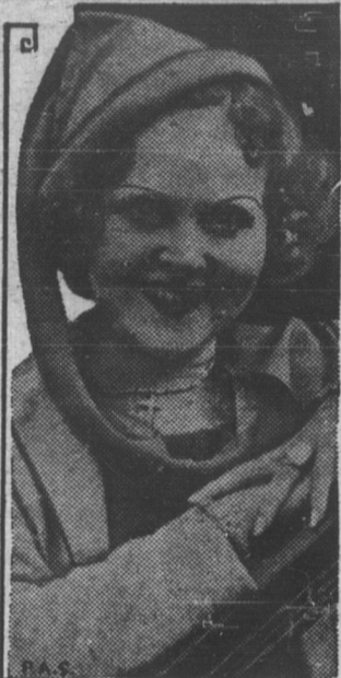
NEW YORK... Creators of hat fashions have solved the lost scarf problem in the clever new ski hat which will be worn this coming winter. The scarf is attached to the top of the hat and falls in folds to be taken around the neck. Hope Hampton (above), brought the style to the U. S.