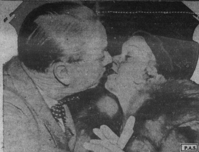
WASHINGTON... Jean Harlow, beautiful blonde movie star, invaded the national capitol steps and received a senatorial smack. 'Twas far from being a reprimand, however. Instead, it was an enthusiastic greeting from Senator Robert R. Reynolds of North Carolina (as shown above) welcoming Jean to Washington as a special Hollywood guest to attend the birthday ball for the President.

here last week visiting relatives and friends.