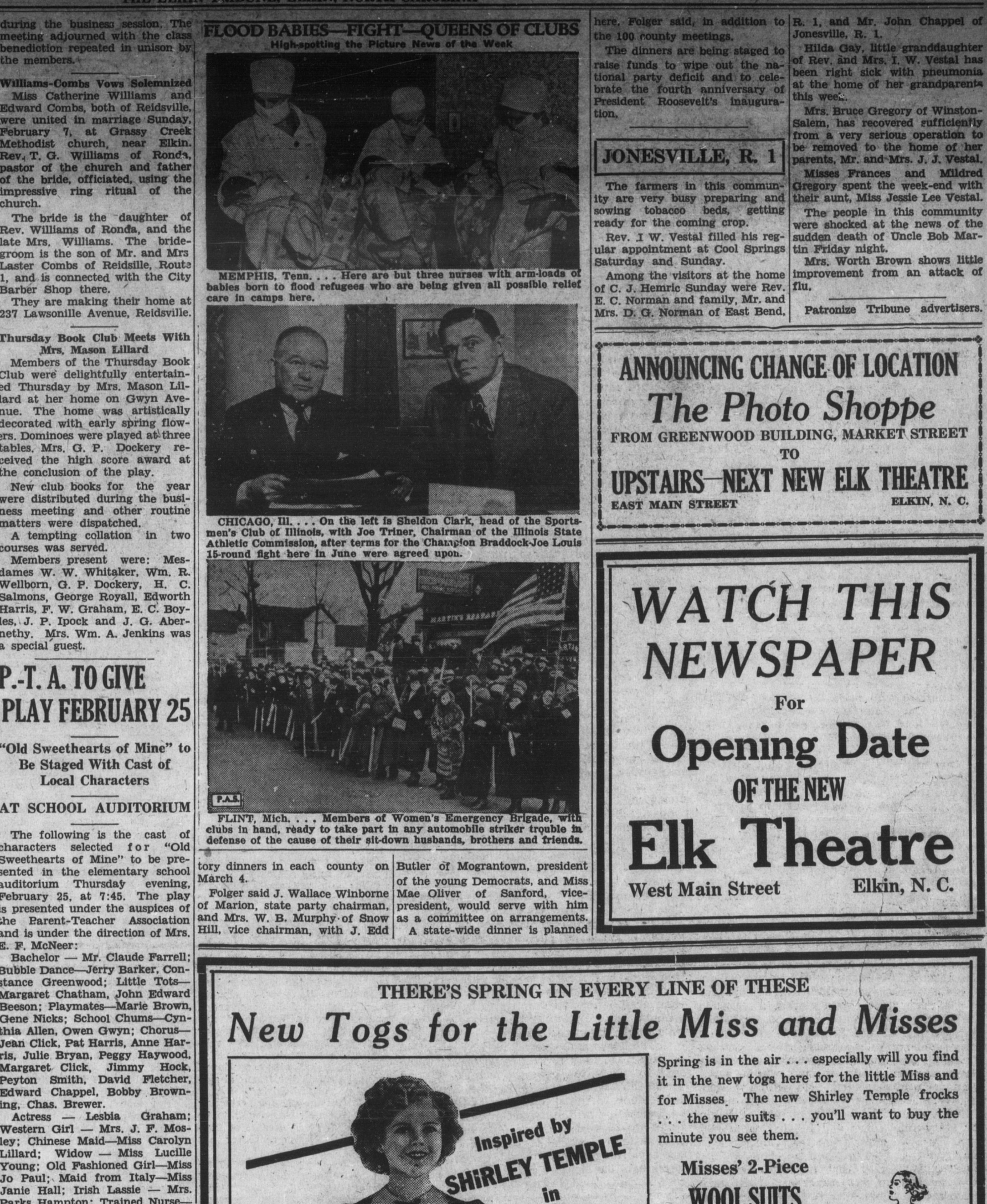
THE ELKIN TRIBUNE, ELKIN, NORTH CAROLINA