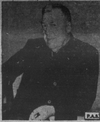
LAKEHURST, N. J. . . . Dr. Hugo Eckener, builder of the ill-fated Zeppelin Hindenburg, heads the German inquiry board seeking to learn cause of the disaster which took a toll of 36 lives.

injuries he received Monday when the ice truck he was driving turned over near Yadkinville.