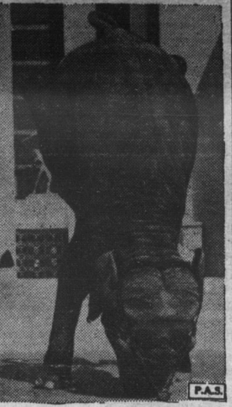
DALLAS, Texas . . . Pit, the elephant, does a headstand in a private exhibition of gymnastics before one of the buildings of the Pan American Exposition which opens here on June 12.