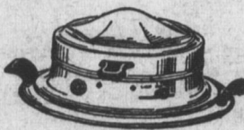
AUTOMATIC WAFFLE MAKER

Adjustable—Light, Medium or Dark. Soft signal light tells when to pour batter and when waffles are ready to serve. Beautifully Panelled Top. Chromium Plate.