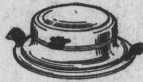
LOW-BOY WAFFLE MAKER

Bakes golden brown waffles exactly to your taste. Heat indicator tells when to pour batter. Patented expansion hinge allows batter to raise. Beautifully finished in Chromium Plate.