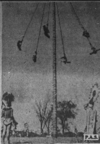
CHICAGO, Ill. . . . Spinning around in the air as rope tied to their waists and wound around the top of the huge pole unwinds, these daring Otomi Indians exhibit their death defying ritual "The Flying Pole Dance."