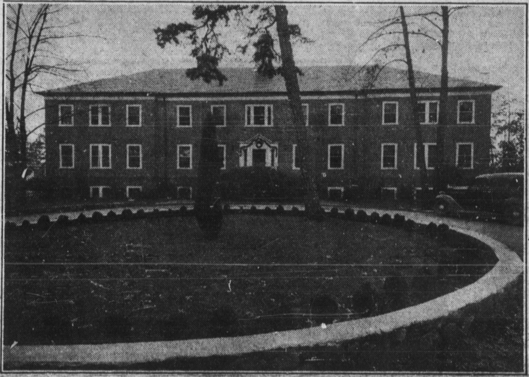
Top photograph shows the new addition to Hugh Chatham Memorial Hospital, which will be formally dedicated today. This picture was taken from the east side, and in addition to the new wing, also shows the south end of the original plant. The bottom photograph is a view of the front of the original hospital building.