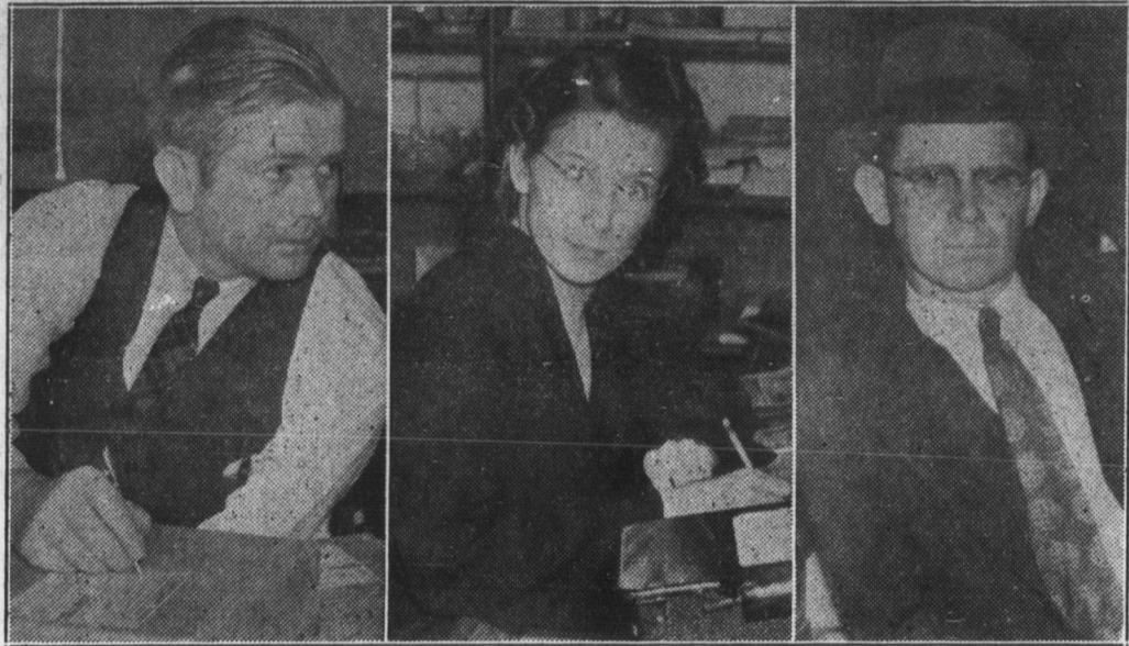
The Tribune candid photographer went indoors for this week's quota of pictures, photographing those whose labors aid in keeping the wheels of business turning. The manager of one of Elkin's finest department stores, a stenographer and an automobile salesman, all are eligible for two free tickets each to the Lyric theatre, if they will kindly call at The Tribune office. Six more free tickets will be given away next week. Watch The Tribune.