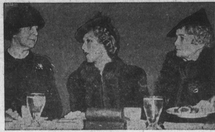
WASHINGTON, D. C. . . . Mary Pickford, famous movie star, in a talk before the Women's National Press Club, called for "America to arm to the teeth" against European Dictators. Miss Pickford denounced Dictators and demanded that women back a big National Defense program. Left to right: Mrs. Cordell Hull, Mary Pickford and Mrs. Claude A. Swanson.