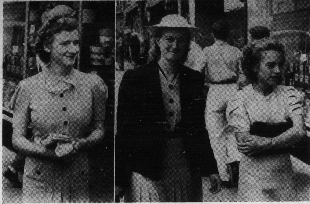
More free theatre tickets await at The Tribune office. If those persons pictured above will call and ask for them, each will be given two tickets, good for admission to both the Elk and Lyric theatres. More pictures good for free tickets next week.

MILL WORK Elkin Lbr. & Mfg. Co. "Everything to Build Anything"