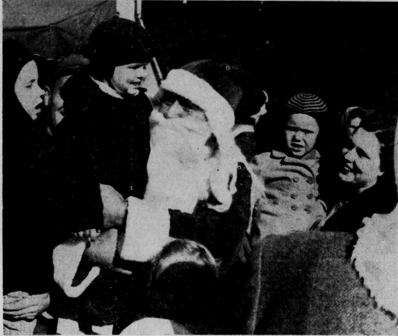
SANTA CLAUS COMES TO TOWN — The arrival of Santa Claus in Elkin Friday afternoon was an occasion of joy and wonderment for local youngsters. In the photo above, the jolly old gentleman has a merry twinkle in his eyes as he tells the young fellow in his arms that he'll be back Christmas with a sack full of toys. The tot at left looks on in open-mouthed amazement as he awaits his turn to tell Santa what he wants for Christmas.